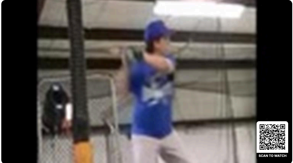
05-06 PAL Bullets Tribute